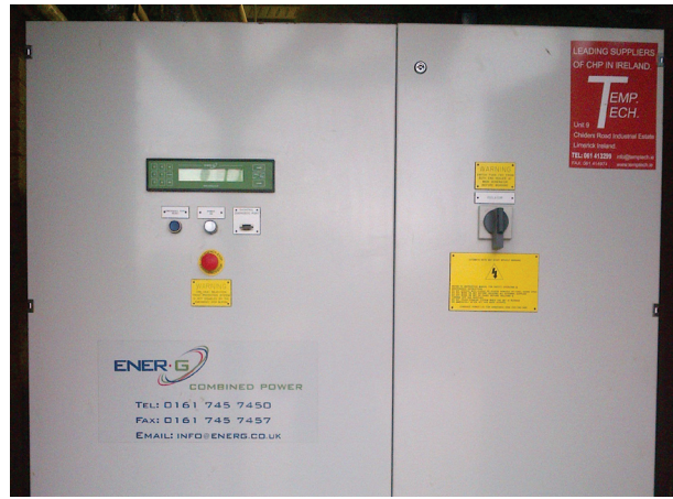
Figure 1: ENER-G Combined Heat and Power Unit