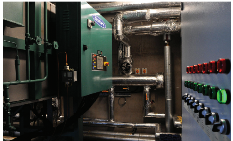
Figure 2: Century Absorption Chillers from Comfort Cooling

for the building, and the energy within the hot water can also be used to provide cooling and air conditioning through absorption chillers.